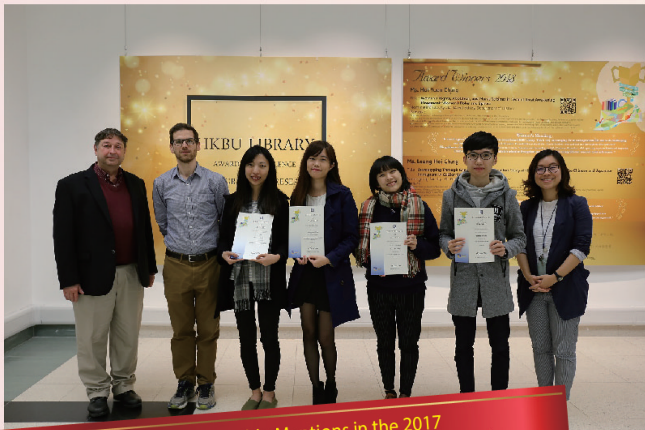
A HIST Minor won the Honourable Mentions in the 2017 HKBU Library Awards for Excellence in Undergraduate Research

We have been one of HKBU's top two/three Minor Programs since 2018!